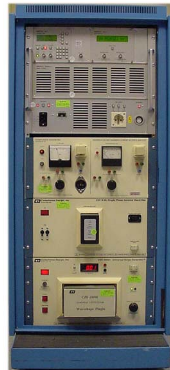
EN 61000-4-5 Surge 4 kV Mains Power, 2.2 kV I/O Cables