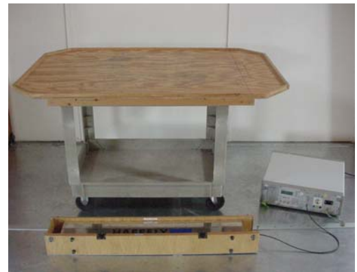
EN 61000-4-4 Electrical Fast Transients 4 kV Direct, 2 kV Injection