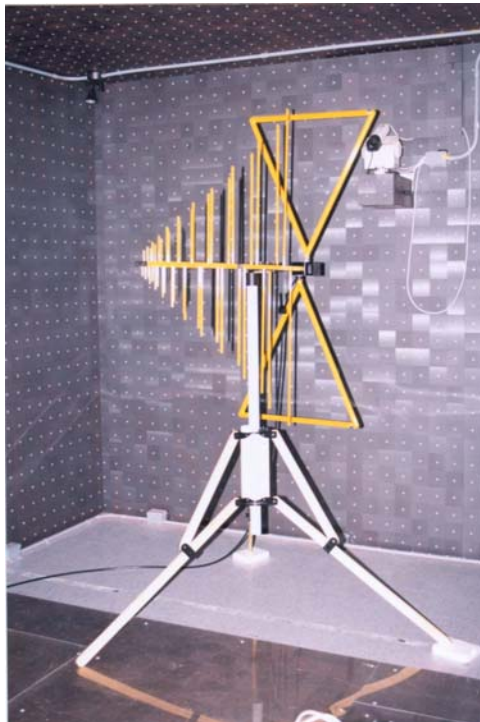
EN 61000-4-3 Radiated Radio Frequency Ferrite Tiled 12' x 20' x 10' Chamber with Uniform Field at 3 & 10 volts per meter